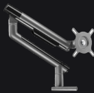
*Wall Mount (From third-party brands)